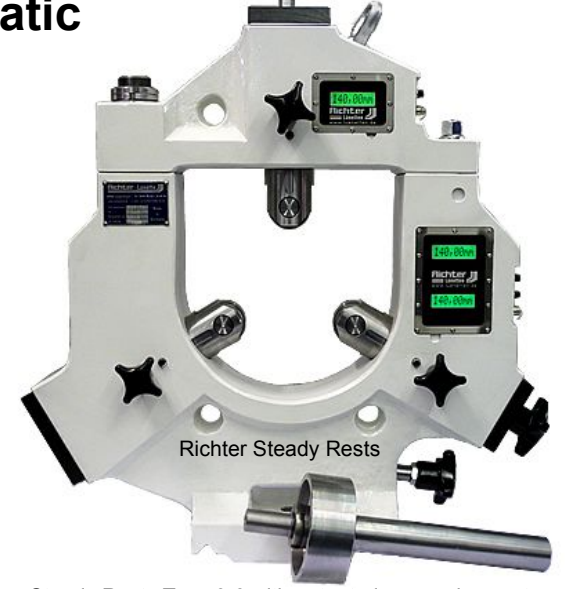
Steady Rests Type 3-6 with patented measuring system

This makes Richter Steady Rests® indispensable aids for machining such work pieces. Through years of practical experience, H. Richter Vorrichtungsbau GmbH has managed to manufacture steady rests in a modular design system.